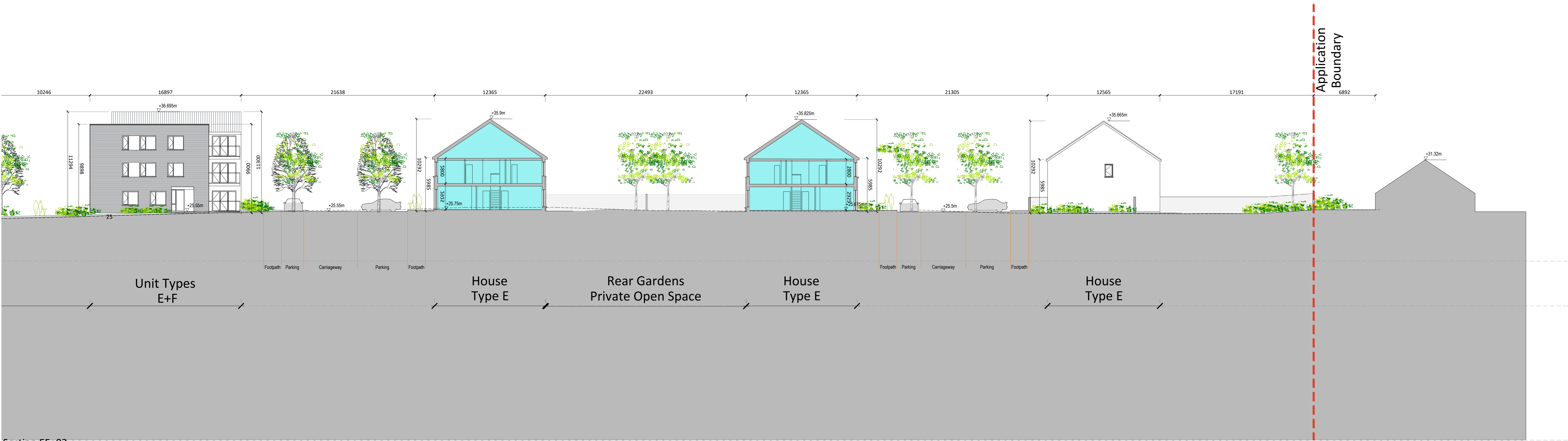
Section EE_02 Esc 1:200