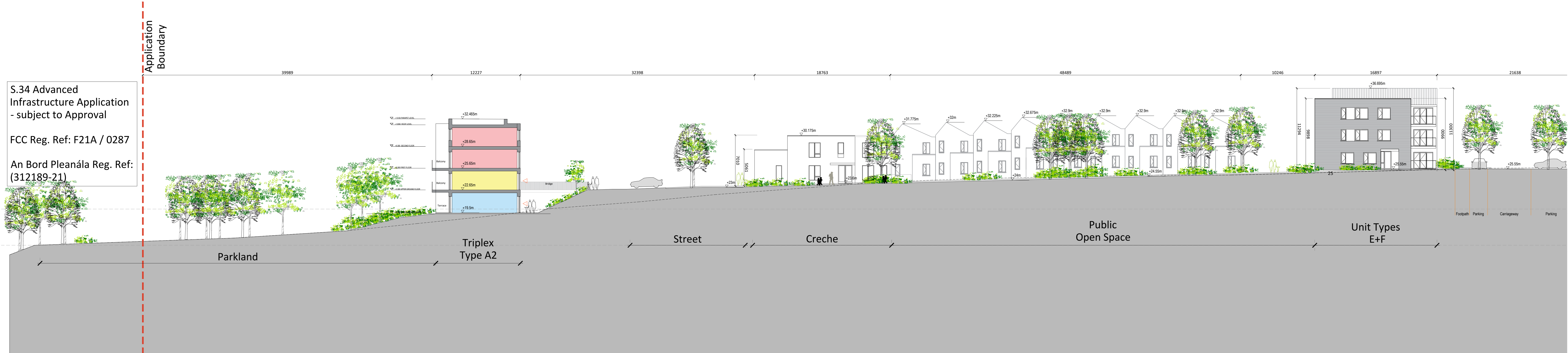
Section EE_01 Esc 1:200